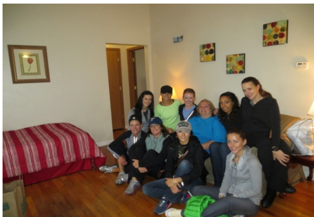
Volunteer Project with the Blues Wives