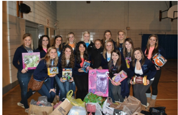
Lydia's House Holiday Gift Drive